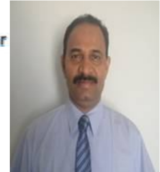
VP-Operations & IT